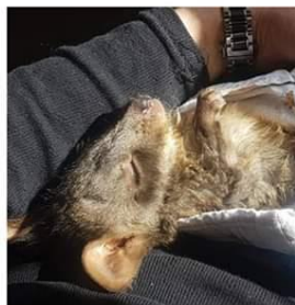
Wallaby joey Sophie a little milk drunk on a sunny day - Tasmanian Animal Rescue, Rehabilitation, & Education Services

Some rescuers prefer fabric outer pouches, not crochet/knitted pouches. This is because little joeys like chewing, and it can be dangerous if they unravel and swallow long threads or yarn (they can get tangled in the intestines and cause other digestion issues). If you prefer to crochet/knit pouches, please check these are acceptable to the rescue you donate to.