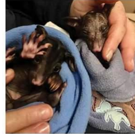
Brushtail possum joeys - Tasmanian Animal Rescue, Rehabilitation, & Education Services