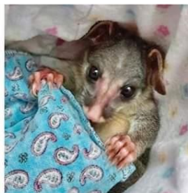
Sydney Wildlife Rescue

Tiny claws get caught on a lot, and raw seams have too many threads that can fray and tangle up a joey. Keeping seams sealed is safer, and makes the pouch more durable through many washings.