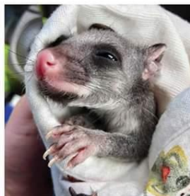
Save Our Wildlife Foundation