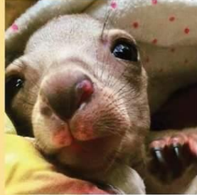
Felix, an eastern grey joey, enjoying a snuggle - Western QLD Wildlife Rehabilitation